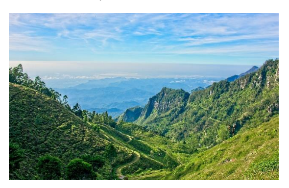
Contact us for more details and customization of tour